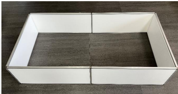
b) Maze Block Wall (2)